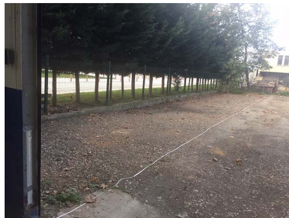
Fig. 5 Manual calibration using a 20 m track

In the manual calibration case, the workshop setups a track of 20 m length and the vehicle is physically driven along this track. In this case, the calculation of the pulses can be triggered either using an optical system as shown in Fig. 5, where the optical systems triggers the calibration device to start and stop counting pulses using reflector located at the beginning and end of the 20 m track that reflect the light beam send out of an optical device that is connected to the calibration device. Alternatively, the workshop personal can hit the start and stop count buttons on the calibration device while the vehicle enters the 20 m track and it arrives at the track end. In the latter case, there is an additional error source introduced, which is the response time of the workshop personal to recognize vehicle position and response time to hit the button.