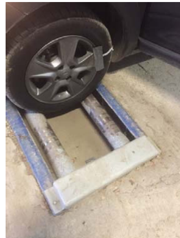
Fig. 4 Rolling road for automatic calculation of K -factor

change as a result of the current position of the gearbox.