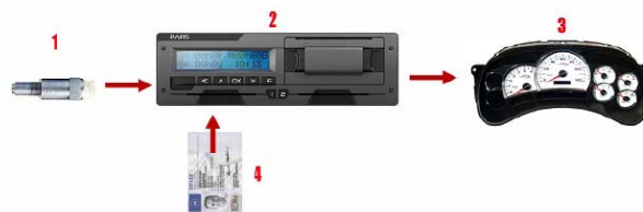
Fig. 1 Components of the tachograph system

The digital tachograph system consists of the vehicle unit (VU) (usually referred to as the tachograph itself) (2), motion sensor (1), and smart cards (4) used in the system as shown in Fig. 1. The VU is also used to drive the vehicle cluster (3).