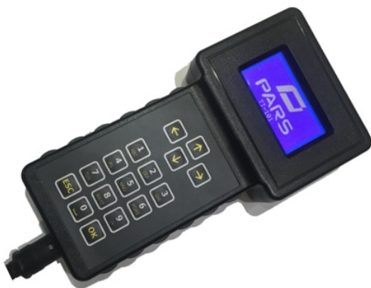
Fig. 3 Calibration device used to input parameters into VU

The Pars TT-101 calibration device is shown in Fig. 3. A tachograph calibration device is used to input parameters and values into the tachograph. This calibration device is directly connected to the VU through the front connector of the VU. This connection enables the calibration device to concurrently count pulses received by the VU (from the motion sensor) as well as enables simulation of vehicle speed so that the workshop can test if the VU displays speed and odometer information correctly and the vehicle cluster is driven successfully. Every workshop is obligated to possess a calibration device.