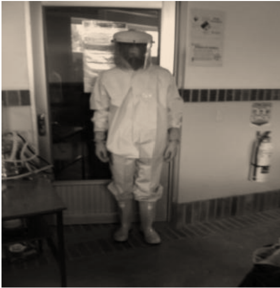
Fig. 2 Personal Protective Equipment