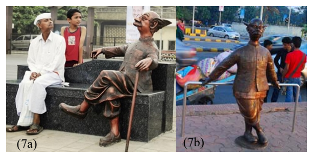
Fig. 7 (a) R.K. Laxman's Common Man at Worli sea face, Mumbai [15] (b) R.K. Laxman's Common Man at Worli sea face, Mumbai [16]