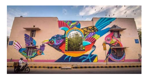
Fig. 6 Colours of the Soul by Senkoe. Inspired by the beauty of nature at Lodhi Art District [13]

Similarly, like New Delhi, Mumbai is another important city in India where Public Art has started gaining momentum. Mumbai also lacked any history related to Public Art and the only form of art in public spaces seen for a long time are the statues of notable men erected during British Raj. Being an exceptionally fast paced city, Mumbai does not stop or pause to appreciate any new addition within the urban space, and this has led to the failure of many Public Art endeavours. Another reason for the failure is the lack of open/public spaces. Mumbai's density being very high has caused the city to lose most of its urban fabric which is readily seen in international cities such as New York, Chicago, and London.