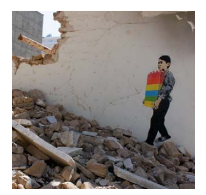
Fig. 4 This stencil depicts the loss of innocence for many children of Iran's urban lower-strata, often forced to work to supplement their families' low income [9]

The above discussion demonstrated how governments of different countries have actively supported and encouraged art in the public domain which has changed the meaning of art from art in public places to art as public spaces, to art in the public interest [6].