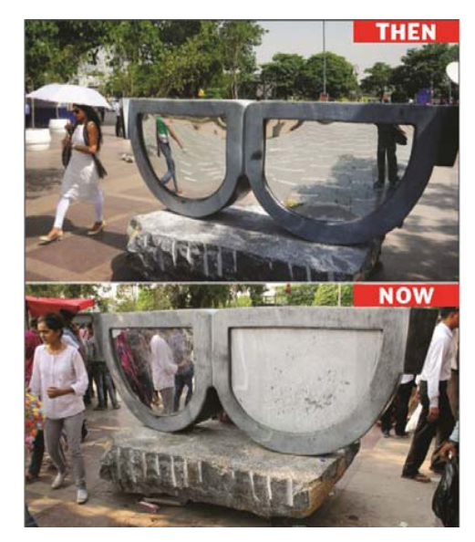
Fig. 5 Vandalized public art initiative at Connaught Place, New Delhi [12]

public participation which helped people to understand and relate to the canvases; (2) central location of Lodi Colony with shaded walkways to encourage pedestrian movement and, (3) the liberal display of art making it accessible to all enabled a successful Public Art project within Delhi.