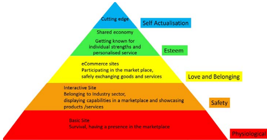
Fig. 1 Maslow’s theory adapted to eTransformation

source of systems and functionalities. This indicates that the structure of the operations and process need to change, so that the required operations can seamlessly be completed.