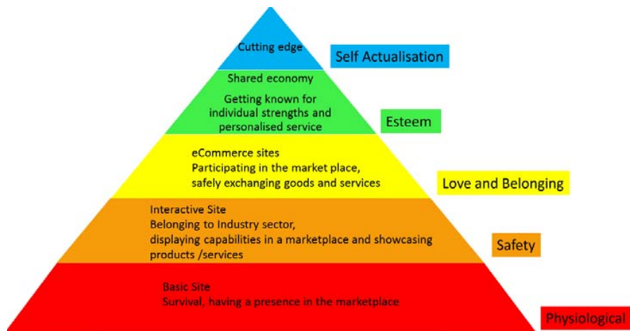
Fig. 1 Maslow's theory adapted to eTransformation

source of systems and functionalities. This indicates that the structure of the operations and process need to change, so that the required operations can seamlessly be completed.