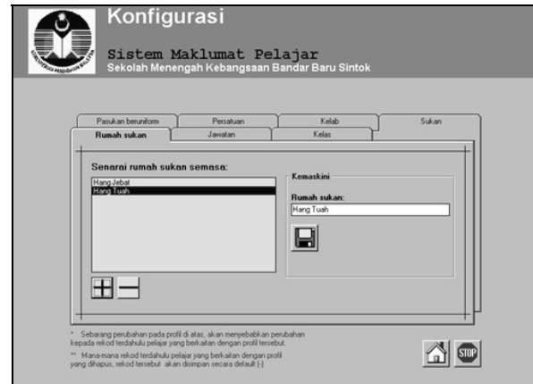
Fig. 2: Interface of SIS configuration

The user could print out students' details information in a format introduced by the Ministry of Education. This function is used for preparing testimonial letter for graduated students. Other than that, the system allows its users to change their password, system configuration that includes add, edit or delete list of classes, clubs, sport houses or position. This function is shown in Fig 2.