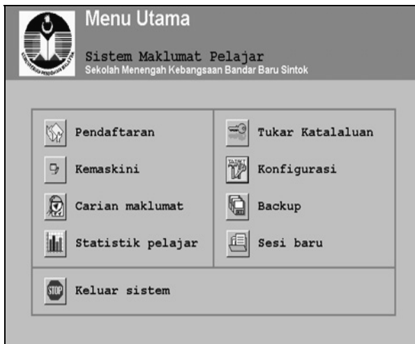
Fig. 1: Interface of SIS main menu

The information system is of a stand-alone type where it can only be used solely on a computer without having to connect to other computer as it is one of the requirements specified by the client. The system keeps record on students' details that includes personal information, co-curriculum activities and discipline. Meanwhile, the method of user interaction with the system is through filling out forms, accessing menus and buttons for direction. The users could search for students according to certain personal particular or co-curriculum activity through the search interface. The main menu interface of SIS is shown in the following Fig 1.