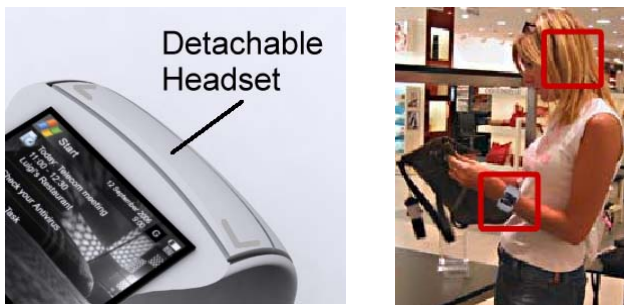
Fig. 9: the integrated/detachable headset

Thinking this new concept we had also to take into account what was a third key requirement of the users that is not making your communication patterns more complicated with the introduction of two items instead of one. We had so to think about a concept that integrated the headset in the wrist phone, detachable when necessary (i.e. incoming calls) but part of it and not requiring a separate recharge manner (fig.9).