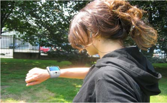
Fig. 4: Concept A usage scenario

To get the material to be submitted to the users, specific scenarios have been built for each Persona. Scenarios are essentially stories about the characters and what they do in their daily life [5] having a plot that marks actions and events. They can encourage reflection during the process of design but especially are very flexible and can be quickly revised according to change in design needs [4]. The Personas, which are used as round characters within them, may focus the attention of the designer on the desires and needs rather than on the mere actions, helping in the designing of future services where there are no specific "a priori" requirements defined [18, 19].