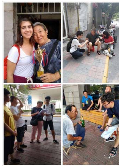
Fig. 4 Students have a field research on the living situation of resident in historical block, International Joint Planning Workshop of China, Britain and America in 2018

practice of urban planning discipline, which would broaden the horizon of teachers and students to know the new direction of internationalized research (Fig. 7).