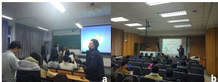
Fig. 2 Course Scenery of Research Methodology and Academic Writing