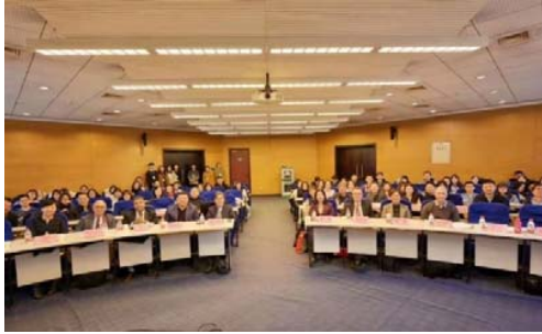
Fig. 7 Abundant international exchange activities of teachers and students in planning discipline