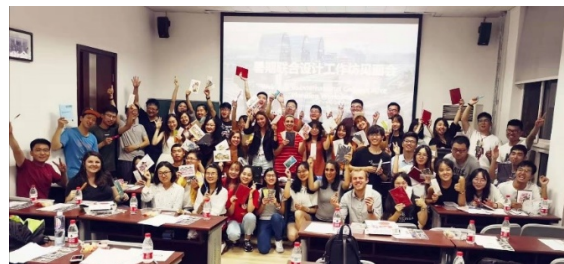
Fig. 5 Students in the workshop reports the design achievement, International Joint Planning Workshop of China, Britain and America in 2019