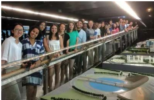
Fig. 3 The students participating in the workshop visit the Tianjin Urban Planning Exhibition Hall, International Joint Planning Workshop of China, Britain and America in 2018

needs. They choose the design theme and teaching content of ecological planning, rural planning, urban updating, planning management and community planning to have an effective combination between the teaching content with the national development strategy. For example, “International Joint Planning Workshop of China, Britain and America” set from 2018 is cooperated by Architecture School of Tianjin University, Architecture School of University of Texas at Austin, Urban and Regional Planning School of Cardiff University, Public Management School of China Renmin University, Urban Design School of Wuhan University has been held for two years. The “Tianjin Anshan West Road Historical District Renewal” in 2018 and the “Urban Renewal in Xizhimen District of Beijing” in 2019 could enable the students from different countries and various disciplines to complete the planning design, which boosts the exchange and integration of disciplines to improve the planning practice level and communication and coordination ability of students (Figs. 3-6). In addition, the teachers and students of planning discipline positively hold and attend international design exhibition to cultivate professional practice ability and innovation ability. When learning the excellent design thinking and trend in the world, their excellent design thinking would be shown in the international exhibition to enhance the social competitiveness and international influence of planning discipline.