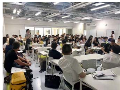
Fig. 6 In the design curriculum teaching, Joint Workshop of 7 Universities in China, America, Japan and Korea in 2019