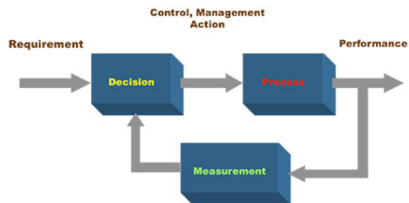
Fig. 1 Components of decision-making information system

who were seeking solutions to their problems. This has resulted in complex decision problems that ultimately have forced business organizations to seek the utilization of the effective tools of operations research. The impressive progress in the field of operations research is due in large part to the parallel development of the modern digital computer with its tremendous capabilities in computational speed and information storage and retrieval. Fig. 1 represents the components of computer information system that support decision making.