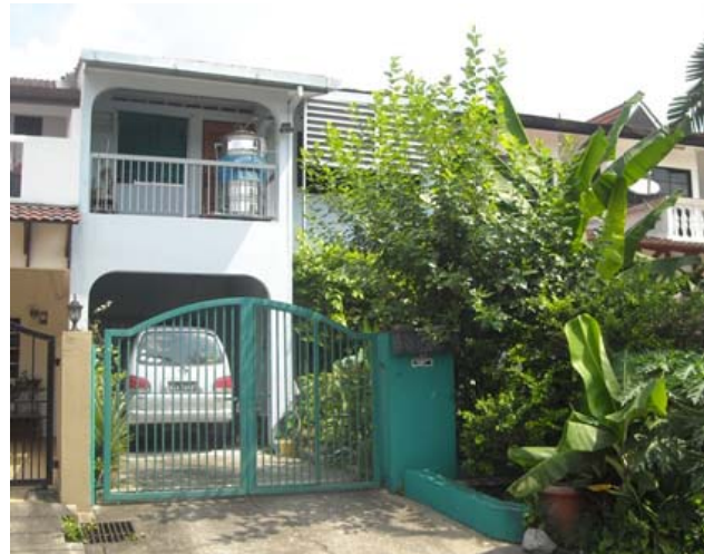
Fig. 2 CETDEM's DCEE House

CETDEM is the acronym for Centre of Environment, Technology and Development, Malaysia. It has been actively involved in research and education to improve the quality of the environment [17]. In doing so, they have modified the late 1970's home of its founder in bustling SS2 urban centre in Petaling Jaya into a demonstration house for public awareness. This was achieved with funds from the Danish International Development Assistance (DANIDA). Construction work took 60 days to complete at a cost of MYR 100,000 [18]. The renovation involved retrofitting the existing roof with reflective aluminum foil to reflect heat from the sun and 'Rockwool' insulation. New counter-battens were laid beneath the reused clay tiles to allow hot air trapped underneath to move freely out of the roof. New aluminum louvers are also fitted to shield all windows from morning and afternoon sun.