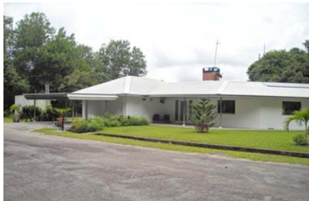
Fig. 4 CoolTek House

The house was planned properly with only small walls and windows facing East and West (morning and afternoon sun) and larger fenestrations were orientated to the North and South to receive diffused daylight. The East and West walls were also shaded away from the sun by vegetation. All fenestrations were set deep into the external walls and were sheltered by deep overhangs that stretched around the house. The foundation of the Melaka house was a conventional concrete trench to carry the load bearing walls which effectively reduced the amount of concrete and steel reinforcements needed to build the house. The load bearing walls were made of 250mm thick AAC blocks and painted white to mitigate heat and sound transmissions while the windows were all double glazed with a low emissivity coating to stop heat radiating through [30], [31].