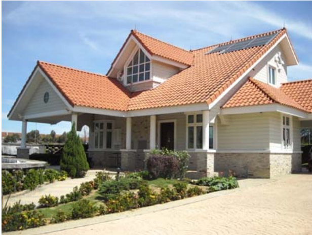
Fig. 3 Smart and Cool Home

the foundation, external water tank, driveway and fence absorb heat from other parts of the house and occupants and dissipate it quickly. In order to complement the construction system, night ventilation was also practiced at this house. No a/c was installed at the house. The interior of the Semenyih house has been recorded to be at least 7°C lower than outside temperatures [23] which needed only the ceiling fans to increase air speed within the house to achieve thermal comfort.