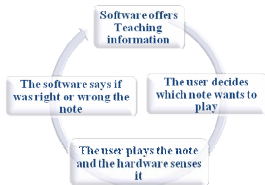
Fig. 4 System Dynamic

The main result was the successful implementation of hardware device that captures the basic musical notes which are being played on a flute and transmitted to the computer, where the interaction is consistent and efficient.