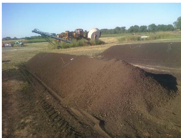
Fig. 1 Photo of swine manure compost piles

Photoacoustic Gas Analyzer (Innova model 1412, Innova AirTech Instruments A/S, Denmark). However, only ammonia and nitrous oxide will be reported and discussed in this study. The Innova 1412 multi-gas analyzer was setup with a 1-second sampling integration time and fixed flushing time: 2 seconds for the chamber and 3 seconds for the tubing. The required time to complete one sampling cycle for ammonia, carbon dioxide, methane, nitrous oxide, and dew-point temperature measurements was approximately 70 seconds. The response time of the analyzer to step changes in gas concentrations was tested. The gas analyzer has a built-in compensation for water and cross interferences. The gas analyzer was tested using a pre-mixed standard of gases. The tested concentrations ranged from 90% to 94% of standards for all gases.