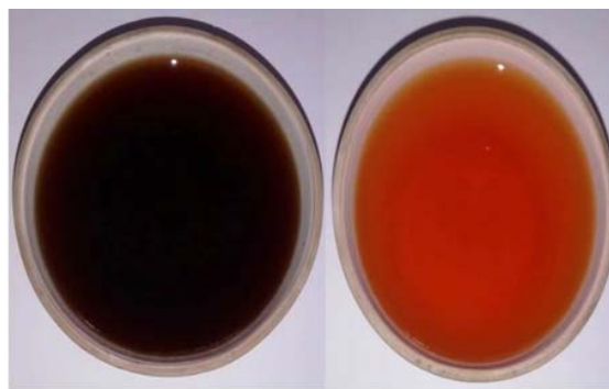
Hard water tea brew Soft water tea brew

It is clear from the above study that the hardness of water mainly affects the quality of tea brew. Soft, neutral, or slight acidic water should be used for brewing. Tea brewed with soft water retains quality, but hard water containing minerals reacts with tea polyphenolic compounds to give inferior liquor. Most