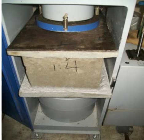
Fig. 1 Sandcrete blocks compressive strength test setup