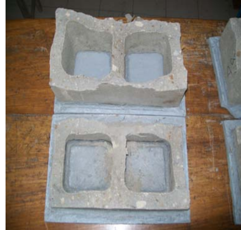
Fig. 3 Fracture shape of sandcrete block specimens