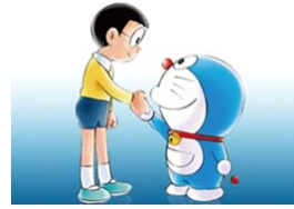
Fig. 5 Left: Nobita, and right: Doraemon

Images of the paper are used from the related websites of Doraemon, etc.