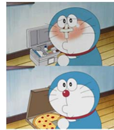
Fig. 4 Upper original version: Doraemon with a bandage on his face, and lower US version: pizza