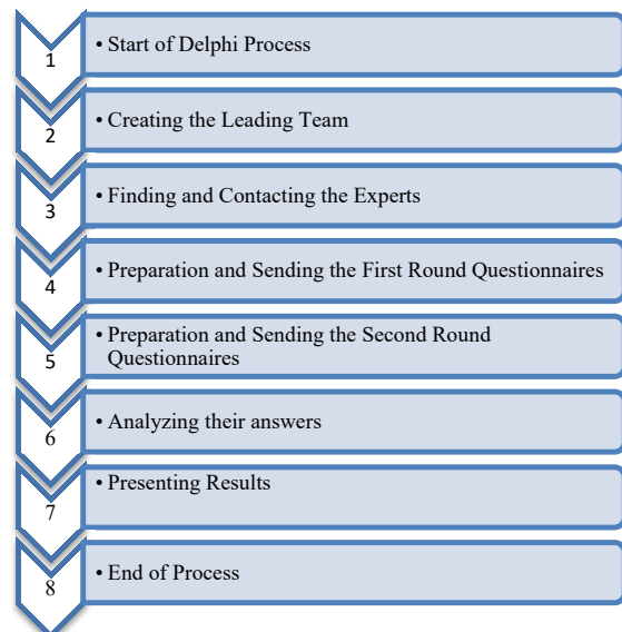
Fig. 3 Delphi Process