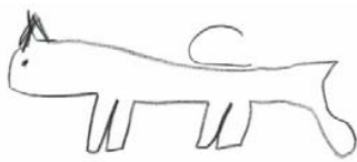
Fig. 2 'Failed attempt' child 1

In contrast to the girl, the horse is static, which emphasizes the passive role of the animal from the girl's point of view. It is drawn with little details and hardly resembles a horse. The red tail is striking. The horse was drawn much smaller than the girl, which emphasizes the overriding role of the girl. In addition, the horse was drawn with a rather human face, which shows the humanization of the animal. It is striking that the animal is not standing on the ground but seems to hover just above it. Perhaps the girl expresses a floating feeling that she perceives while riding. The lack of contact with the ground can also symbolize insecurity [23], perhaps insecurity or fear of the horse.