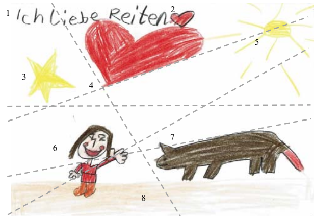
Fig. 1 Child drawing 1

of the picture. The girl painted herself with orange pants and a red top. The girl's right arm is pointing down, the left one is pointing up. The girl has medium-length, dark brown hair and a red mouth. The horse is dark brown and the tail is red. It is elongated, has short legs and is not very detailed.