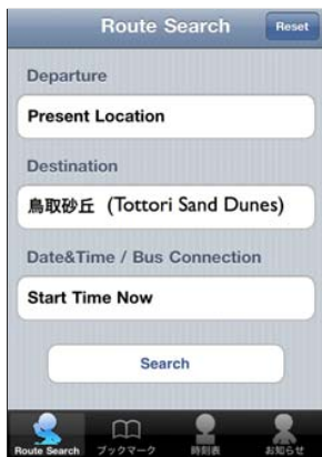
Fig. 4. Top page of the interface