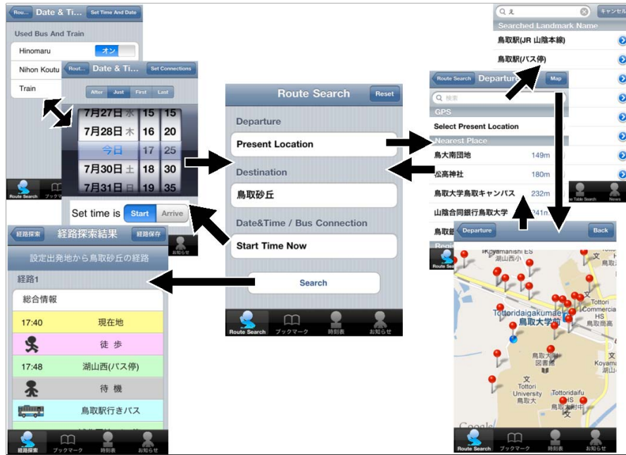
Fig. 3. The application interface switches with screen