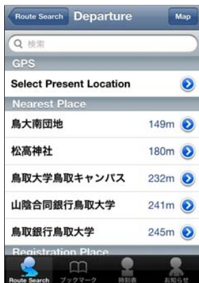
Fig. 5. Set to landmark

Evaluated number of user action is the total sums of respectively coefficient of evaluation multiply count of actions. Coefficients of evaluation are value of table I. A coefficient of switched screen is heavy cost. However, a coefficient of scrolled screen is light cost.