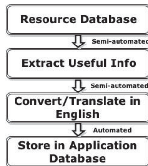
Fig. 2 Phase II - Information from Resource DB to Application DB

components and frameworks are employed as the starting point. The software is developed in phases where some parts of the complete system are developed in initial or prototype phase. We utilized all these modern concepts of software development. Several of the components developed for one web application are later utilized by the others. Similarly, the information or database is shared between applications.