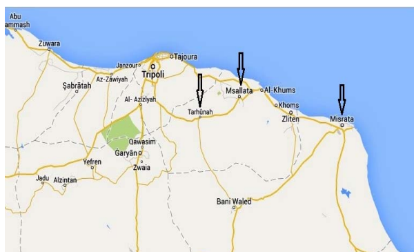
Fig. 1 The location of municipal wastewater treatment plants

Reagents used in this study were of the highest available quality i.e. analytical grade. All solutions and dilutions were prepared in bidistilled water.