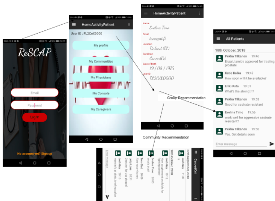
Fig. 2 Illustration of community interactions on recommendations sharing

The community component of the design addresses what happens between a care receiver and care providers. It also allows interaction and recommendation sharing among different players on the platform. These are the care receivers, physicians and care givers. Each of these has roles defined for them on the platform which also guides their access to care receiver's data. This community component has been implemented with the development of a prototype mobile app called ReSCAP. It provides a good platform for individuals with same illnesses to share treatment methods, drugs and dietary advice real-time regardless of geographical locations. It also allows real-time interactions among patients thus enhancing their cognition and social value. The physicians can be able to share research and treatment ideas among themselves based on consent obtained beforehand. Fig. 2 shows the recommendation sharing that can be possible between a physician and his patients and how recommendations can be shared among people in the community.