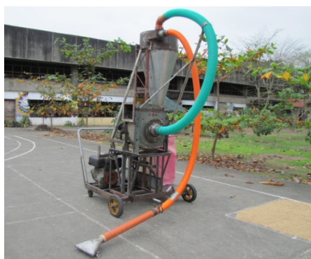
Fig. 2 Mobile engine-driven pneumatic paddy collector

A simple mobile engine-driven pneumatic paddy collector made of locally available materials using local manufacturing technology was designed, fabricated and tested for collecting and bagging of paddy dried on concrete pavement. The mobile engine-driven pneumatic paddy collector had the following major components: power transmission system, air mover, conveyance system, bagging area, and frame. Fig. 2 shows the actual mobile engine-driven pneumatic paddy collector. The specification of the machine is presented in Table I.