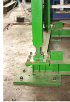
Fig. 2 Flange partially cut-out at the bottom end of column

Damage of the structure is simulated by cutting out a small portion of the flange near the bottom of the column(s), as shown in Fig. 2. In order to sufficiently examine the damage at various extents, the damages were progressively enforced on one side of the frame from the 1 st storey to the 3 rd storey. It is meant to represent a moderate damage condition as a single column being damaged and a serious damage condition as two columns being damaged in the same storey. Totally six damage conditions have been considered in the tests. The 1940 El Centro earthquake has been adopted as the input with the PGA scaled to 0.1g.