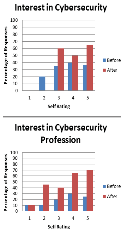
Fig. 1 Student's self-ratings in various aspects of cybersecurity

of Academic Excellence (CAE) designation promotes research and a pipeline of professionals in the field of cybersecurity starting in colleges and universities. Courses integrate the knowledge areas as determined by the Department of Homeland Security that are needed to ensure that students are well-trained and have the cybersecurity skills necessary to promote the growth of the cybersecurity workforce [7]. The development of relevant curriculum materials, such as laboratory modules, courses re-design, and new courses will give students in-depth knowledge on several topics. Topics such as emerging security threats, new countermeasure with computing technology to prevent these threats, cybersecurity principles and policies, and other security related issues are all important. Curriculum developments such as new courses, new tracks/concentrations as well as new programs in cybersecurity also seem to engage students in cybersecurity [8]. Also, incorporating cybersecurity into the curriculum will give and encourage students to do research/projects in cybersecurity field.