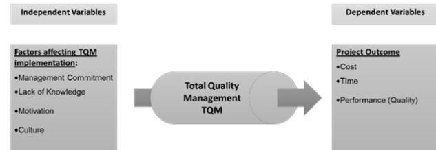
Fig. 1 Research Model

The following model which is presented in Fig. 1 will be used in the study.