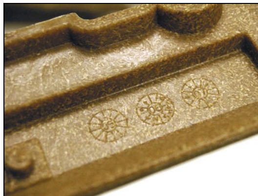
Fig. 4 Embossing on the Biocomposite

If longer fibers are desired, then flax, hemp, kenaf and cotton can be mixed with fibers of thermoplastic polymers. Subsequently, this is hot pressed to form the thermoplastic fiber for forming the composite. In this manner, thermal insulation can be improved with Biocomposites which can be valuable in reality sector as part of carbon efficient housing.