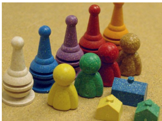
Fig. 1 Uses of Biocomposites

natural polymer. In the contemporary scenario, due significance has been provided to synthetic and fossil derived polymers which may be either virgin or recycled.