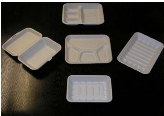
Fig. 5 Variety of shapes of packaging units made of EFB