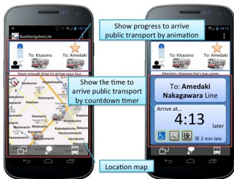
Fig. 6 Navigation on waiting state

On the waiting state at the bus stop or the station, a passenger is not just waiting with doing nothing. At first, if he/she takes a train, he/she must buy a ticket before riding the train. Secondly, he/she must go to the platform to ride a train. In addition, if he/she wants to drink something, he/she might go to the vending machine. Our system shows a map of the station, location of a vending machine or a store around the user, and countdown the departure time of the train. Figure 6 illustrates a user interface for the waiting state.