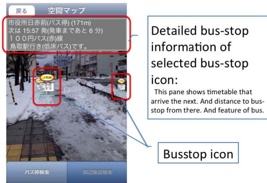
Fig. 4 AR navigation on "Bus-Net" system

The technology of augmented reality (AR) is being suited for real information. This technology can pile information on display showing real-time movie from camera. Therefore we developed to support bus users with AR technology [12]. This system provides information about bus-stops around user. And it provides information of buses coming close in the user. This system can reduce anxiety about buses. For example, it is anxiety about the bus late more then average when the bus comes. In addition, it is more instinctive to understand for showing information on real view. It is simple to use this system on smartphone. If user wants to know information, he/she has to hold the device only. Thus AR navigation is one of the ideal way at real-time navigation.