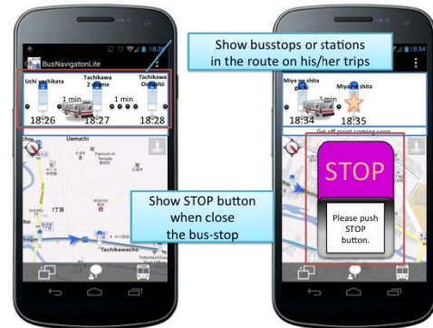
Fig. 7 Navigation on riding state

After the user ride a public transport, the navigation system goes to the riding state. On the state, the system shows a map and progress to the destination. When a passenger is arriving at the destination, the system alerts the user to get off. If he/she must transfer another transportation at that point, the system shows the way to move to the next point and information of the next transport. Figure 7 illustrates a user interface for the riding state.