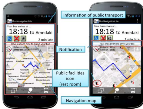
Fig. 5 Navigation on walking state

our system gives more specific information about public transport. Fig. 5 illustrates the user interface for the walking state.