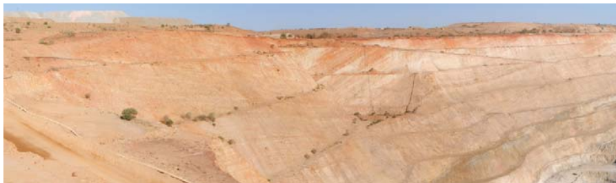
Fig. 2 Photograph showing condition of slopes in highly weathered siltstone – effectively zero slope failures 20 years after excavation

Conversely, with the 5,000 Monte-Carlo simulations approach, this basic understanding around the controlling input parameters is less evident.