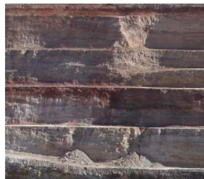
Fig. 3 Photograph showing two 'rare' localized 10 m high wedge failures in lowest bench of weathered siltstone

After 20 years of mining in the weathered siltstone in the pit of interest (Fig. 2), effectively zero slope failures had occurred at similar slope design geometries to those analysed. Minor wedges (less than 10 m in height) have failed in localized areas and account for less than 1% of total bench slope crests (Fig. 3). Based on an observational approach, the FS in the slopes is above one (i.e. above equilibrium) and the PF is 0-1%.