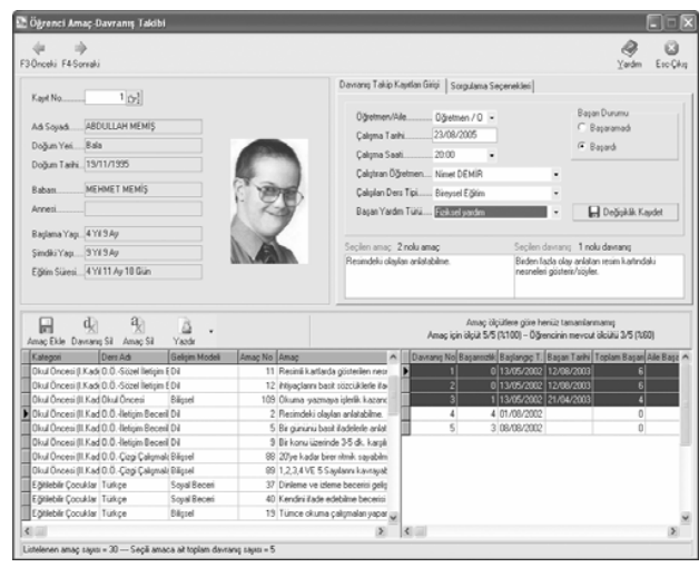
Fig. 1 Data entry form

Since accurate data entry is very important for later evaluatory works, a carefully designed data entry form is supplied for the user. A snapshot of the data entry form is given Fig. 1. The data that are collected through data entry form can easily be exported to other software or databases. This facilities support the use of collected data for other purposes.