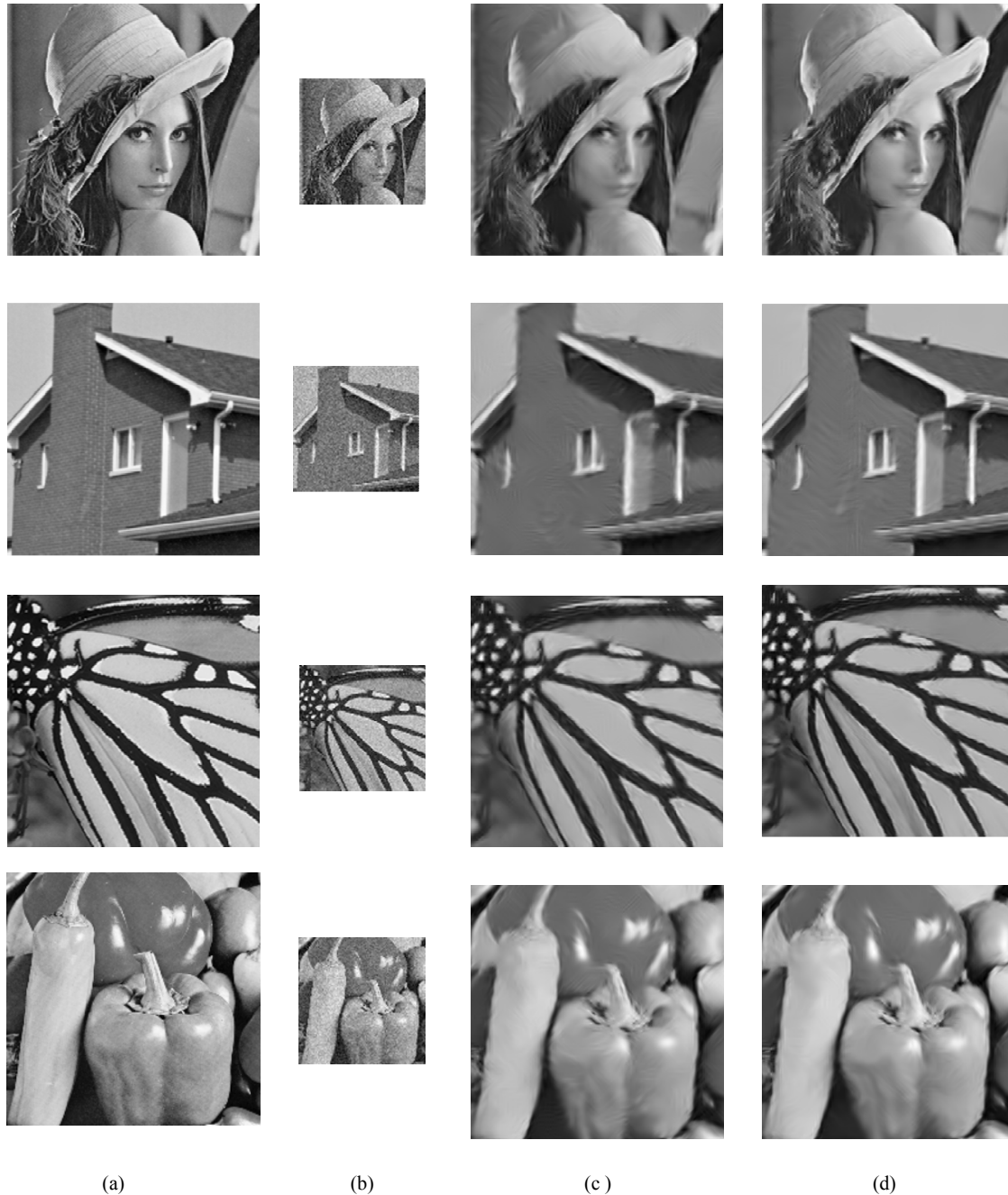
Fig. 2 (a) Original HR image (b) LR noisy image (c) Denoised and interpolated image via LMMSE (d) Denoised and interpolated image by the proposed scheme