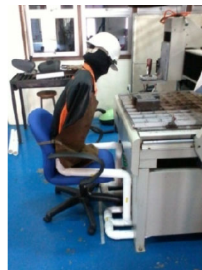
Fig. 2 Dummy welder in sitting position