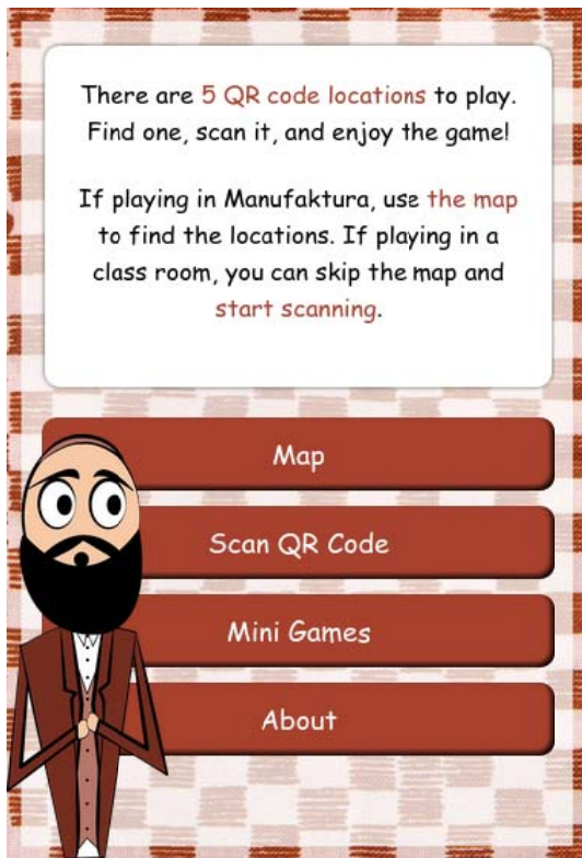
Fig. 7 Weavers game, screenshot from Samsung Galaxy S3

leaders. These meetings had a great impact on the teams. It gave the students a chance to share their experience and to appreciate their creative and business strengths as being of the same importance as the work being done by the technical students.