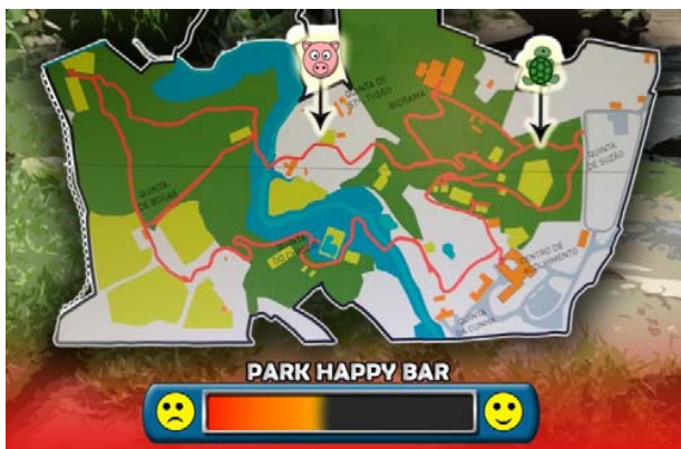
Fig. 1 Park Heros, game map, screenshot iPad

PhoneGap (Cordova) is a framework that allows programmers to build applications for mobile phones and tablets. Although PhoneGap is theoretically a multiplatform [8] framework, the students were asked to focus on preparing a prototype of the game that would work on Android mobile devices.