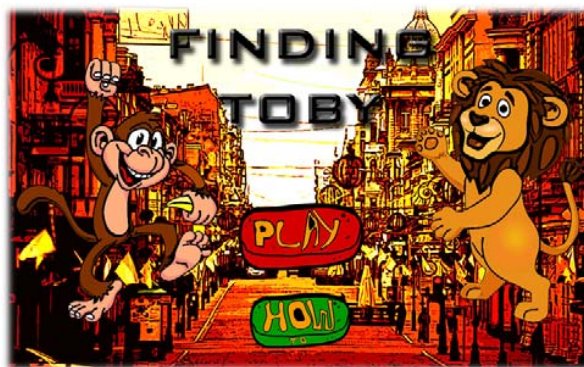
Fig. 5 Finding Toby, Phoenix level, screenshot

Students were encouraged to consider the real-world business applications of their games. In Porto, the park management asked that two of the prototype games be developed further. In Lodz, two business partners asked that the prototype games that were developed for them be continued further.