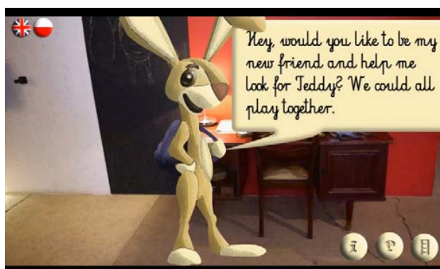
Fig. 6 Game of dolls, screenshot from BB Z10Ltd

In both Porto and Lodz, students used the Agile software development methodology [9].