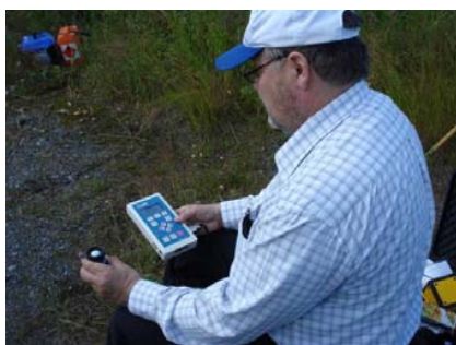
Fig. 3 Measurements of UV in summer