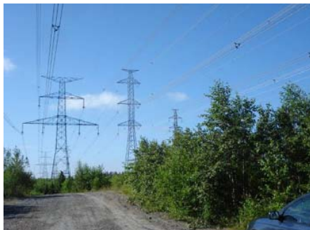
Fig. 1 Measurement site on a summer day