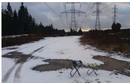
Fig. 2 Measurement site on a winter day