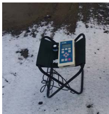
Fig. 4 Measurements of UV in winter