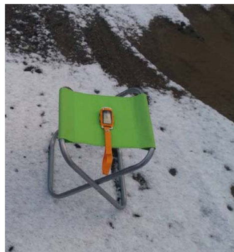
Fig. 5 Measurements of UV-index in winter

mW/m 2 (Table II). The measurements were taken in the middle of the day (11:00 – 15:00) on July 20 in Tampere Region, and these values represent the Finnish maximum values.