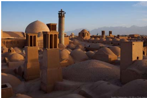
Fig. 1 A view of a traditional pattern in Yazd (city in center of plateau of Iran). Domical roofs minimized possibility of heat exchange in dry and hot regions [10]

Use of renewable energies such as wind and solar energies is another characteristic of the mentioned regions. Buildings are designed for four seasons; they benefit from the maximum temperature in the winter and the minimum temperature in summer. Furthermore, the basement (Sardab) and Shuvadon were built normally in the summer-living part and had several floors underground to reduce the temperature around 15 to 20 °C. In some of the houses, a branch of the aqueduct passed through the cellar and provided easy access to the water [9], [7].