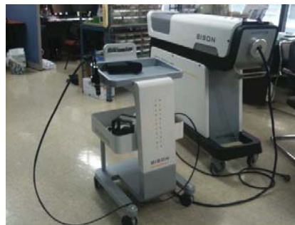
Fig. 1 Copper bromide laser equipment

Bison medical Co., Ltd (Seoul, Republic of Korea) for this purpose. This copper bromide laser equipment consists of optical fiber delivery system and air cooling system and laser tube with 1,100 mm size, which has two wavelengths of 511 nm and 578 nm with maximum output power of 12 W (Fig. 1). This copper bromide laser system consists of laser tube, high power supplier, main control board, handpiece, fiber, foot switch, LCD module, filter wheel, motor wheel (ON/OFF wheel) and other components as shown in Fig. 2. Additionally, there are control part and sensor part which modulate the irradiate laser, also filter part use the two different wave length of copper bromide laser selectively.