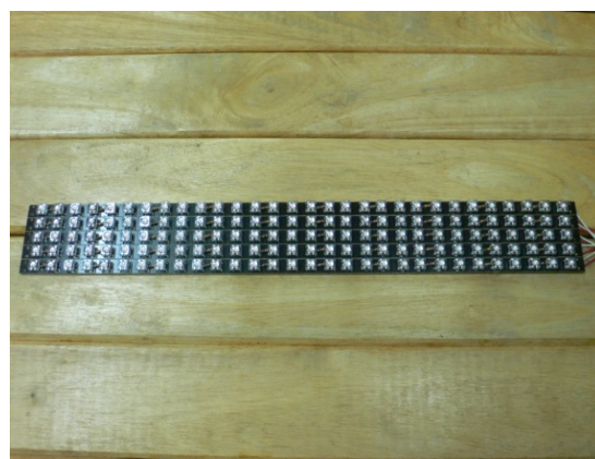
Fig. 5 Experimental set of luminous efficacy of LED tubes

Step 2: To test luminous efficacy and electricity supply