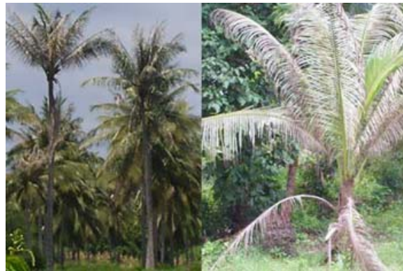
Fig. 1 The damaged coconut plantation by the adult coconut hispine beetle