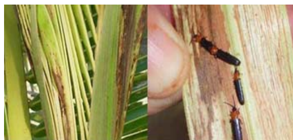
Fig. 2 The adult coconut hispine beetles

The coconut hispine beetle ( Brontispa longissima Gestro), the indigenous pest, which lives in Indonesia, Papua New Guinea, and Malaysia, is one of the most damaging pests for the coconut palms including ornamental palm species in many countries in Asia and the Pacific region. The outbreak of coconut hispine beetle has caused substantial production losses without less product quality; once in the past the coconut palms discolored from green to gray [3]. Adult coconut hispine beetles, around 1 cm long and 2-2.5 mm wide, are flat with yellowish brown thorax and black elytra as shown in Fig. 2. The larvae and the adults feed on leaf tissues of the developing, unopened coconut buds. In the stage of full growth, they become insects of Coleoptera.