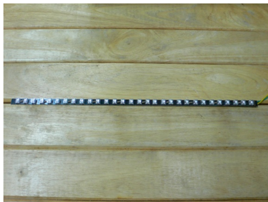
Fig. 4 Thirty sets of forward bias on a LED tube