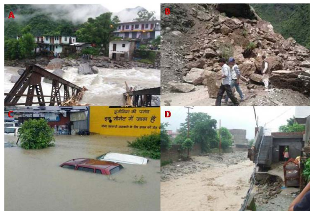
Fig. 2 A. Bridge collapsed due to flashfloods in Kanar village, Pithoragarh; B. Huge landslide on the Gangotri pilgrimage road; C. Roads are over flooded due to cloudburst-triggered floods in Dehradun city; D. Houses collapsed along the seasonal Nala in Kotdwar due to cloudburst (All these incidences occurred in the second week of August 2017)

In the second week of August 2017, cloudburst-triggered flashfloods and landslides have devastated Malpa village, Kotdwar town, and Dehradun city where a number of people died and huge property was damaged (Fig. 2).