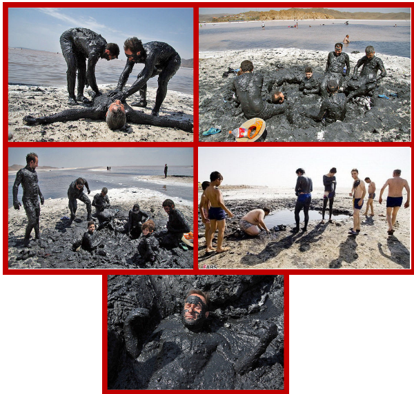
Fig. 2 Therapeutic properties of the coastal sludges and tourists [1]