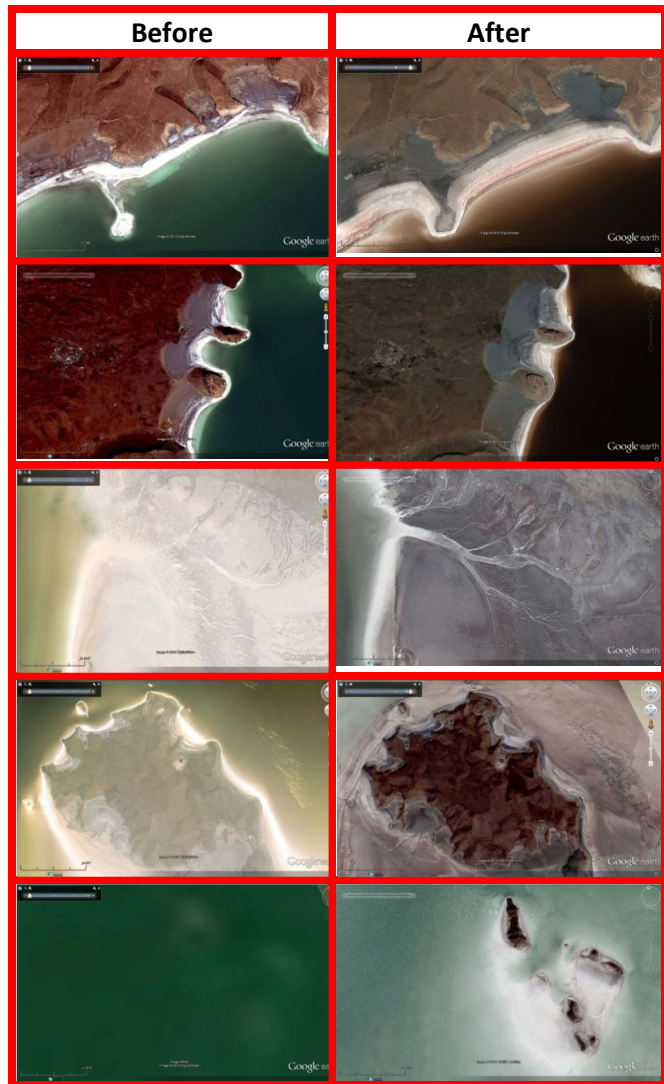
Fig. 4 The conditions of some of geomorphosites around Urmia lake before and after of environmental changes in two recent decades

It was found to have decreased in lake area by about 93 % in two recent decades. These variations are not only driving significant changes in the morphology and ecology of the present lake landscape, but at the same time are shaping newly formed morphologies, which vanished some valuable geomorphosites or develop into smaller geomorphosites with significant value from a scientific and cultural point of view (Fig. 1).