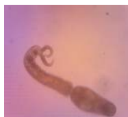
Fig. 6 (b) Brevifurcate-apharyngeate distome cercaria