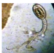
Fig. 7 Longifurcate-pharyngeate monostome cercaria