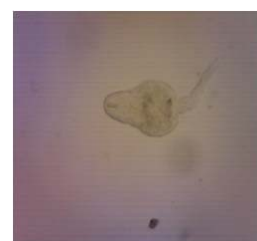
Fig. 5 Xiphidio cercaria