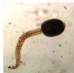
Fig. 4 Gymnocephalus cercaria