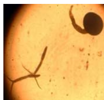
Fig. 9 Mixed infection with Longifurcate-pharyngeate distome and Gymnocephalus cercariae