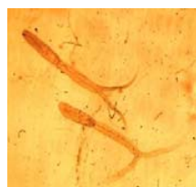
Fig. 8 Longifurcate-pharyngeate distome cercaria