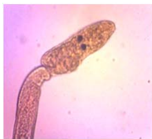
Fig. 6 (a) Brevifurcate-apharyngeate distome cercaria