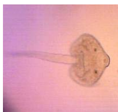
Fig. 2 Amphistome cercaria