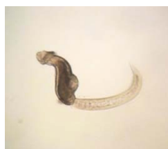
Fig. 3 Echinostome cercaria