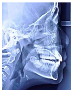
Fig. 5 Patient's lateral cephalograph during treatment and the results of analysis of skeletal parameters (Table III) showed that the patient

had a skeletal Class I malocclusion with normal ANB angle