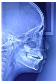
Fig. 4 Patient's lateral cephalograph during treatment and the results of analysis on skeletal parameters (Table II) showed that the patient had a skeletal Class I malocclusion with relatively normal ANB angle

After the correction of patient's skeletal problem has been successfully achieved, the bracket on the lower anterior teeth is then removed and the patient continues the treatment with the use of the trainer only. Evaluation of patient's lateral cephalograph made after a period of 10 months, showed encouraging results in term of positions of the mandible relative to the cranial base and stability as well (Fig. 5, Table III). Patient's facial profile changes from convex to straight. The overjet reduced and the incisors relation became normal.