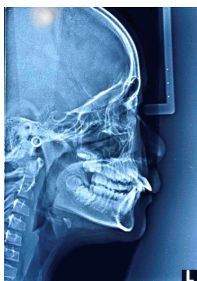
Fig. 2 Patient's lateral cephalograph pre-treatment and analysis results on skeletal parameters (Table I) shows that patients have skeletal Class II malocclusion with retrognathic mandible