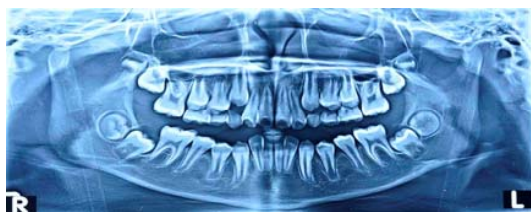
Fig. 1 Pre-treatment record of the patient in the form of panoramic radiographs showed that the patient is in the mixed dentition period and there are no pathological signs

Extra-oral examination showed a convex facial profile with retrognathic mandible and protrusive upper lip. Intra-oral examination showed a significant increase of overjet and crowding in the lower anterior region. The patient is still in mixed dentition period because only two first molars and four incisor teeth on the upper and lower jaws and two lower canines that are permanent teeth, the rest is the primary teeth (Fig. 1). Molar relationship is Class II and the incisor relation showed a significant increase in overjet, thus leading to a diagnosis of Class II Division 1.