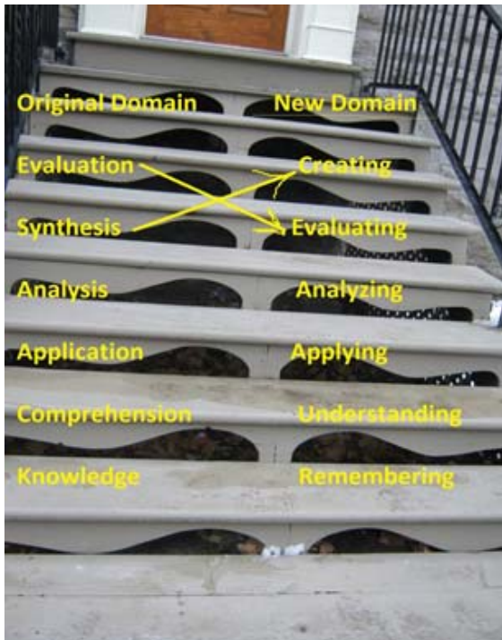
Fig. 1. Schematic view of original and revised version of cognitive domain