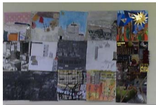
Fig. 4 An illustration of the map of Montreal by participants of a creative workshop at YWCA Montreal, Canada - November 2013

Although there were critical points when Bloom developed the taxonomy, five decades later it continues to guide educational practices. However it is believed that considering the classification of educational objectives in adult education is crucial. Adults, who do not suspend learning, keep their memories fresh for a long time. In the other words the more they keep their learning level higher according to the taxonomy the later experience memory loss.