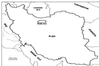
Fig. 1 Location of the study area in Iran regional map

Altitude from free sea level is 1100 m and general slope is 3-5 %. Moderate annual rainfall is 206.4 mm which the most of it occurs in fall and winter and the least of it occurs in summer. Area soils are classified brown-eroded soils with alluvial material. Texture of surface soil is clay loamy and sub-surface soil is heavy-gravelly texture. The slope aspects are eastern and northeast. Exclosures of the study area are divided into two sections include long-term exclosure (45 years, 30 ha, hereinafter 45 EX) and mid-term exclosure (25 years, 20 ha; hereinafter 25 EX). Dominated species are Artemisia sieberi Besser and Stipa barbata Desf along with Stipa hohenackeriana Rupr & Trin., and Salsola tomentosa Moq. Open area also has Artemisia sieberi Besser as main species. Floristic list of the study area is given in table 1 [2], [7], [11].