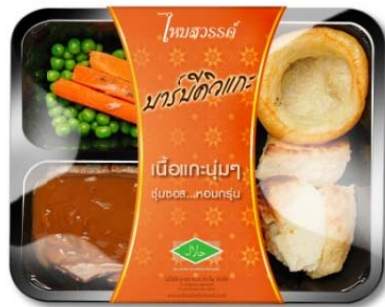
Fig. 9 Benefit Approach on the Category of Instant Foods and Garnishing Ingredient