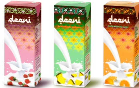
Fig. 13 Value Approach on the Category of Beverages, Desserts and Snacks

products. It is the products of trusty manufacturer, a product of expertise, environment friendly. The brand identity created transform to the packaging design should be sincere, enjoyable, merry, flamboyant, charming, dreamy look and using a humoristic image as on Fig. 13.