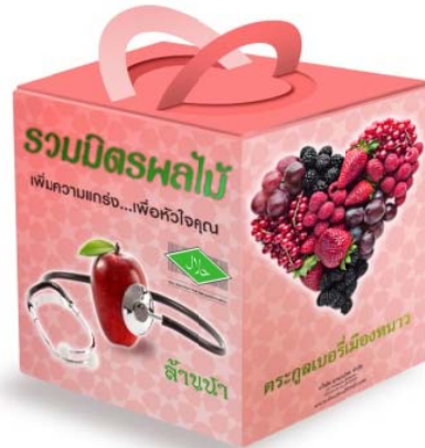
Fig. 8 Personality Approach on the Category of Vegetable and Fruits

The brand Identities of Thai Halal brands with the benefit approach. Consumers will purchase this product with the reason of; fresh and clean materials, there are no toxic or chemical residues; it is a beneficial nutrients product, there are standard of manufacturing and manufacturer's credit. The brand identity created transform to the packaging design should be clear, see through and display a reasonable product as on Fig. 9.