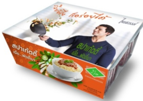
Fig. 11 Personality Approach on the Category of Instant Foods and Garnishing Ingredient

The Personality feedback to them after they were consumes this product such as; they are urbanism looking and multicultural celebrity. They are health care persons. Modernism look, active look and news additive person, thoughtful person like a progressive thinking and social activist. The brand identity created transform to the packaging design should be enjoyable, merry, flamboyant, charming, dreamy look, using a humoristic story and dazzling image as on Fig. 11.