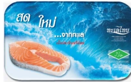
Fig. 4 Value Approach on the Category of Meat

The brand Identities of Thai Halal brands with the value approach. The value of products that affect to consumers perception such as: it is healthy products, accumulate quality of life. It is a product of expertise, manufacturing of research result. Consumers are important. It's sincere, honest and reliable to all. The brand identity created transform to the packaging design should be simply look and using a trustful image as on Fig. 4.