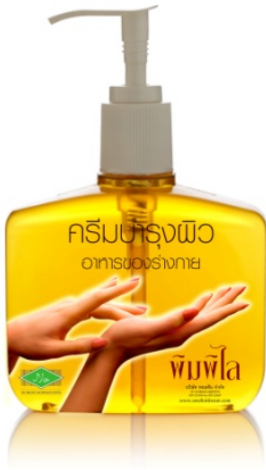
Fig. 15 Benefit Approach on the Category of Hygienic Daily Products

The brand Identities of Thai Halal brands with the value approach. The value of products that affect to consumers perception such as: it is a product of expertise, friendly for all. It is the products of trusty manufacturer. Consumer always comes first as priority service. It is healthy products that accumulate quality of life. Manufacture of research. It is an up to date products. The brand identity created transform to the packaging design should be sincere, enjoyable, merry, flamboyant, charming, dreamy look, using a humoristic story and dazzling image as on Fig. 16.