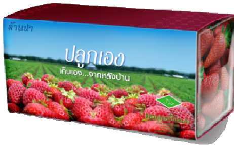
Fig. 7 Value Approach on the Category of Vegetable and Fruits

The brand Identities of Thai Halal brands with the value approach. The value of products that affect to consumers perception such as: it is the products of trusty manufacturer, healthy products, accumulate quality of life, the product of expertise, manufacturing of research result. Consumers are important. It is sincere service, honest and friendly to all. The brand identity created transform to the packaging design should be simply look, represent the origin, story of the manufacturer and using a trustful image as on Fig. 7.