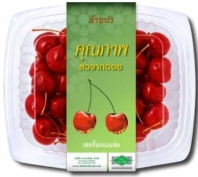
Fig. 6 Benefit Approach on the Category of Vegetable and Fruits

The brand Identities of Thai Halal brands with the value approach. The value of products that affect to consumers perception such as: it is the products of trusty manufacturer, healthy products, accumulate quality of life, the product of expertise, manufacturing of research result. Consumers are important. It is sincere service, honest and friendly to all. The brand identity created transform to the packaging design should be simply look, represent the origin, story of the manufacturer and using a trustful image as on Fig. 7.