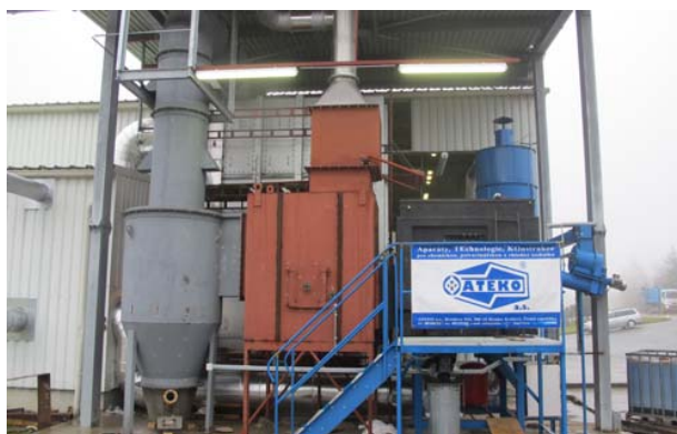
Fig. 2 Pilot plant of EZOB technology [15]

Pilot tests of automatically controlled system were introduced in the end of 2010 and they showed its fundamental operability. The experimental works were up to now focused on attesting basic operational characteristics and optimizing the regulation system and operation of the whole equipment. It was also discovered that the gasifying chamber can be operated without problems also in purely combustion mode that enables its use for combustion of wide range of low-value solid fuels. The fuel is dosed into the chamber continuously from the intermediate storage bin and its amount is controlled by continuously regulated turns of the screw feeder. The advantage of this way of combustion were also very low values of CO and NO x emissions observed when combusting wooden fragments. The temperature of the hot compressed air at the output of the high-temperature exchanger was during the pilot tests limited to 750°C, which naturally influenced the overall lower efficiency of the system (<18 %).