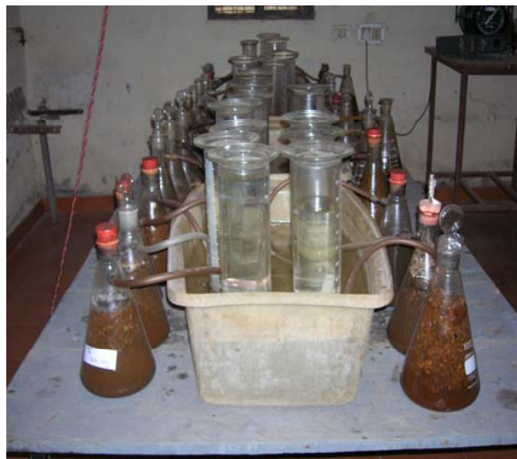
Fig. 1 Experimental set up for biogas production