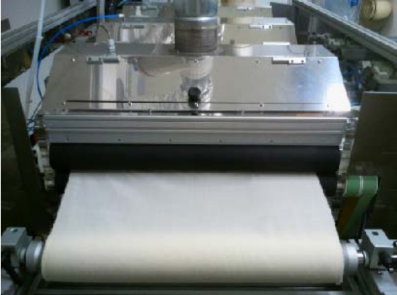
Fig. 1 Innovative Veneto Nanotech machine Nanofabia for in-line treatment of fibrous and web materials

For a deeper comprehension of nature and origin of the observed properties, fundamental studies of the interaction of cold atmospheric plasma with fibrous materials were performed at Veneto Nanotech on wool [2], cotton [3], polymeric, basalt and titania fibers. It was proved the formation of a nano-structure on each fibrous species. Authors suppose the preponderant role of the nano-scale roughness (in the range of tens of nm) generated on fibres by the atmospheric plasma for noted before properties of fibrous and textile materials. In any case, the observed variation of fibres morphology is always combined with chemical modifications the fibre surface, i.e. with generation of polar groups and radicals [4].