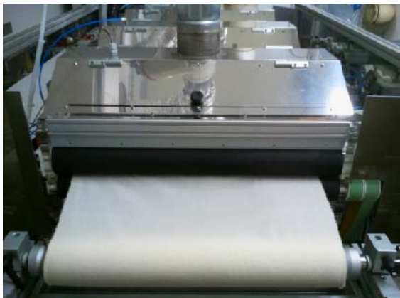
Fig. 1 Innovative Veneto Nanotech machine Nanofabia for in-line treatment of fibrous and web materials

For a deeper comprehension of nature and origin of the observed properties, fundamental studies of the interaction of cold atmospheric plasma with fibrous materials were performed at Veneto Nanotech on wool [2], cotton [3], polymeric, basalt and titania fibers. It was proved the formation of a nano-structure on each fibrous species. Authors suppose the preponderant role of the nano-scale roughness (in the range of tens of nm) generated on fibres by the atmospheric plasma for noted before properties of fibrous and textile materials. In any case, the observed variation of fibres morphology is always combined with chemical modifications the fibre surface, i.e. with generation of polar groups and radicals [4].