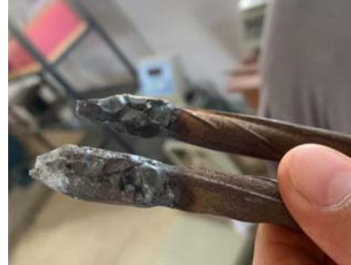
Fig. 2 Sizes of Weld Used

testing setup, and tested samples are shown in Figs. 4-7 respectively. This machine is a displacement based UTM for tensile testing. Loading is applied at a displacement rate of minimum 2 mm per minute to a maximum of 10 mm per minute as shown in Table II.