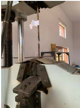
Fig. 6 Testing Setup