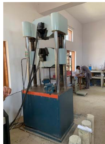
Fig. 4 Employed UTM