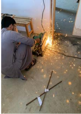
Fig. 5 Preparation of Samples