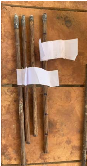
Fig. 7 Tested Specimens