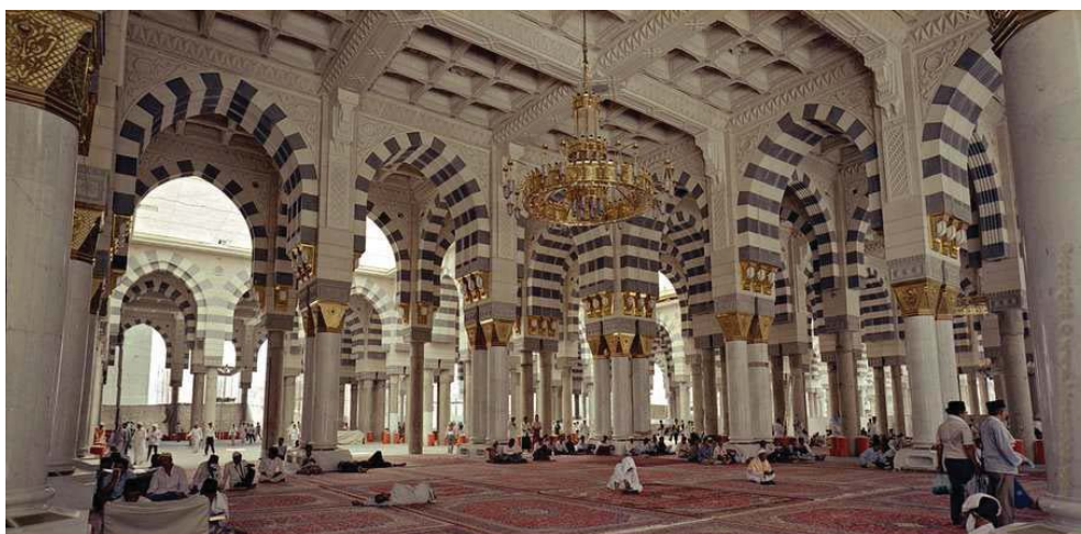
Fig. 2 The Interior of Al-Madinah Holy Mosque

intelligibility of the delivered speech within the Holy Mosque, the analysis of its frequency response, the reverberation time and the mean opinion score. For more details about these parameters, see [3], [12], [13]. In this paper, we focus on the measurement of the Sound Pressure Level (SPL) within the Holy Mosque.