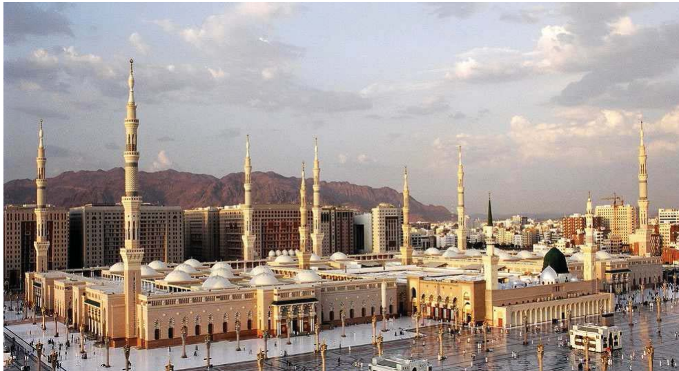
Fig. 1 The Exterior of Al-Madinah Holy Mosque