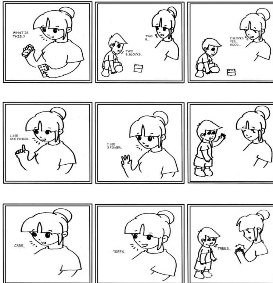
Fig. 2 The proposed and final illustration of written card file checklist number 45 of the language activities, the researcher draws the written text with three choices and asks the respondents if they understand clearly the given pictures; they responded that it is clear and show no revisions since they clearly understood the drawing pictures