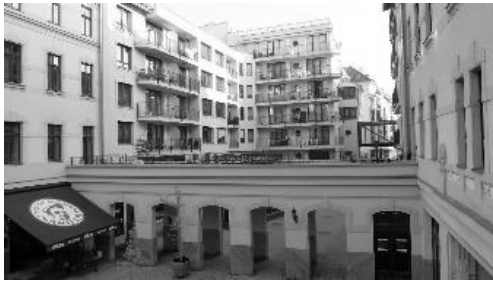
Fig.10 Contemporary buildings in the passage-section of the boulevard [10]

tourism and average condition of the surrounding buildings, however still got criticism for disregarding historical aspects.