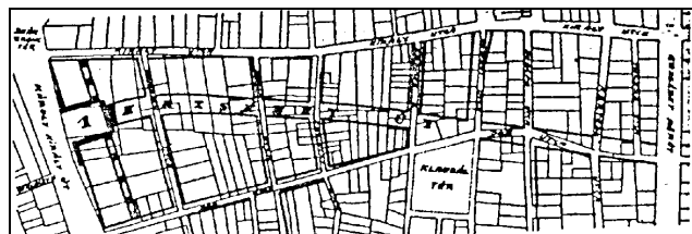
Fig. 9 Plan of Madách Boulevard – only the opening on the left part was finished [7]

Since the 1940’s, various plans had been created and many suggestions were made to finish the project. Some critics pointed out that the plan is disregarding the current structure of the city [8] – the plan would have demolished significant early buildings and monuments, and would have brought a different scale of road and building stock to the area.