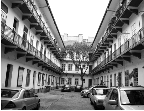
Fig. 7 Larger inner courtyard in the Jewish Quarter of Pest