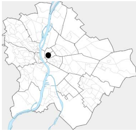
Fig. 1 The Old Jewish Quarter of Pest, in today’s District 7 of Budapest [3]

network, the frequent T-shaped intersections, as well as the diverse width of the streets can be originated from the agricultural past of the area. This kind of organic fabric can rarely be found in today’s regulated Budapest [2].