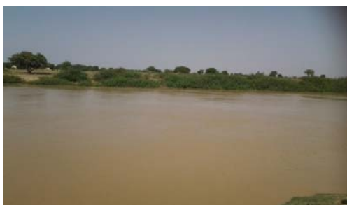
Fig. 3 Station C: Downstream (mostly preoccupied with agricultural activities and waste disposal)

The sampling bottles were pre-conditioned with 5% nitric acid and later rinsed thoroughly with distilled de-ionized