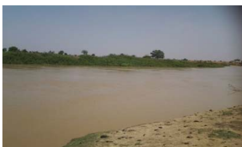
Fig. 1 Station A: Upstream, mostly consist of agricultural activities

Water samples were collected as described by [6], in two 1-liter sterile plastic containers from three designated sampling points in Jega River (fortnightly) between March and July 2014. Three locations were marked for sample collection, namely; Station A (before the bridge; upstream), Station B (at the bridge where human activities such as dyeing, car washing and laundry), and Station C (after the bridge; downstream). Figs. 1-3 show the pictorial presentation of the sampling stations.