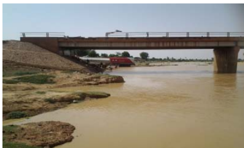
Fig. 2 Station B: At the bridge (domestic and industrial activities discharge untreated effluent into the receiving stream)